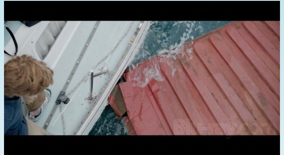
From “All is Lost,” which is not a “how-to”