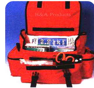
Rescue - Response / EMT Kit by Atwater Carey, Ltd.