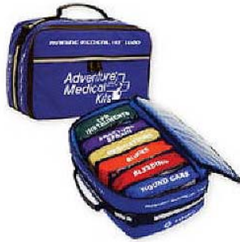
Marine 1000 Medical Kit in Soft Case by Adventure Medical Kits