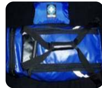
Offshore Marine Medical Kit by MedOfficer.Net