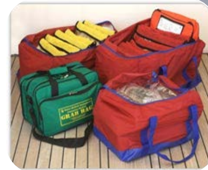
MCA Class A Medical Kit by Ocean Medical Int'l.