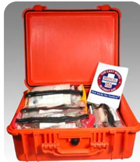
Coastal Cruising Pak in Hard Case by Fieldtex Products