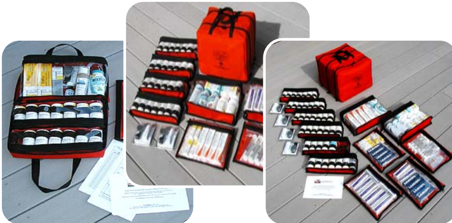
Prescription Kits by OceanMedix