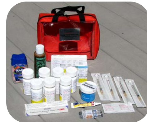
C/V Prescription Medications Module – offshore, small by OceanMedix