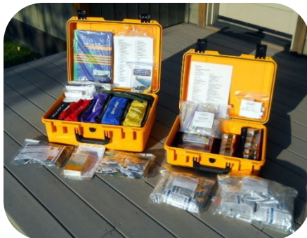
Custom Configured Medical Kit by OceanMedix