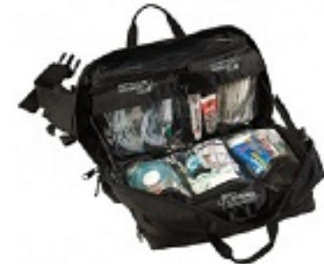
AMK Mountain Medic Pro First Aid Kit by Adventure Medical Kits